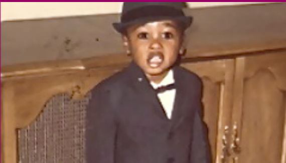
Kipper Age 3 (1965)